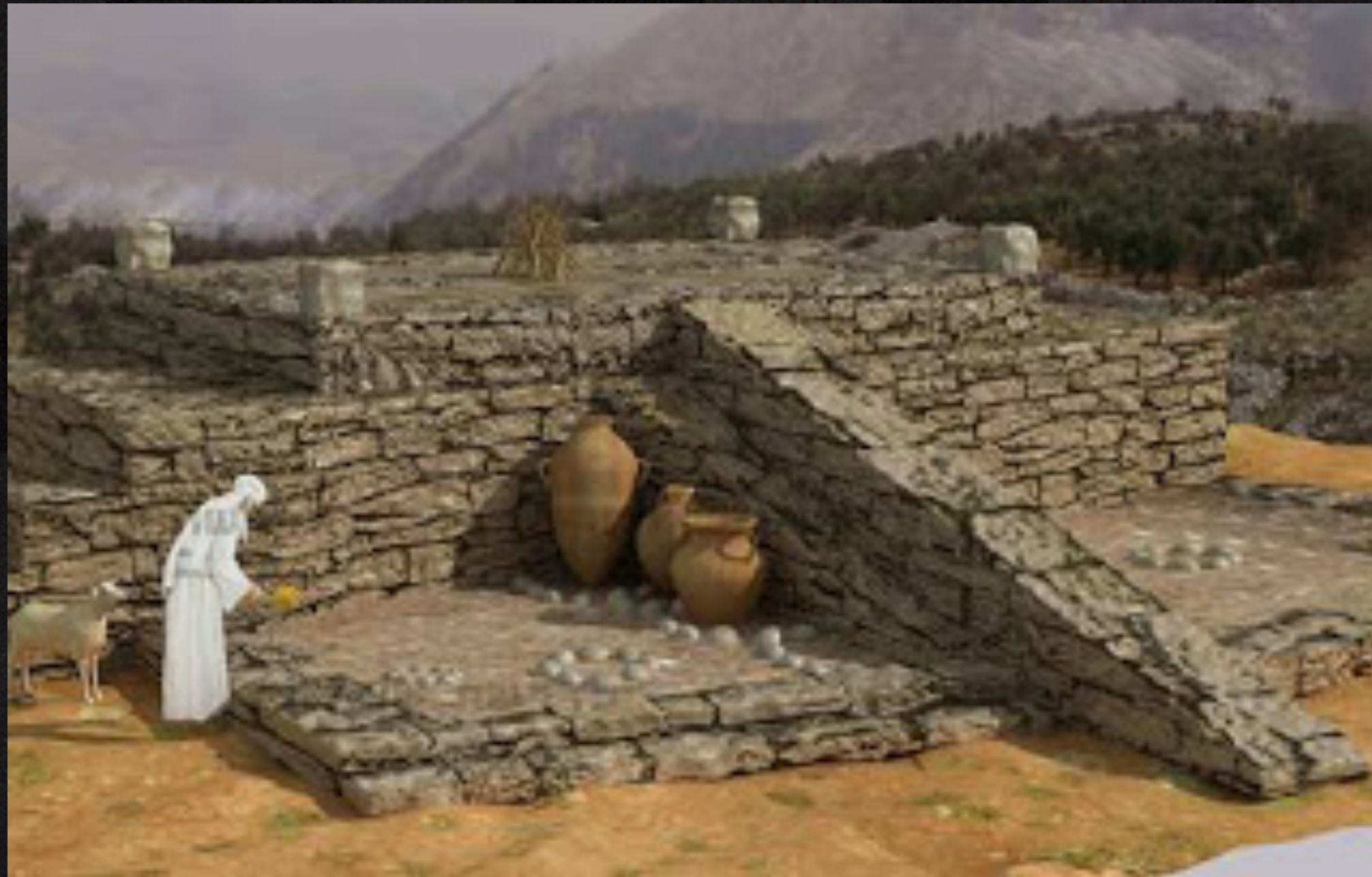
The model altar at Geliloth