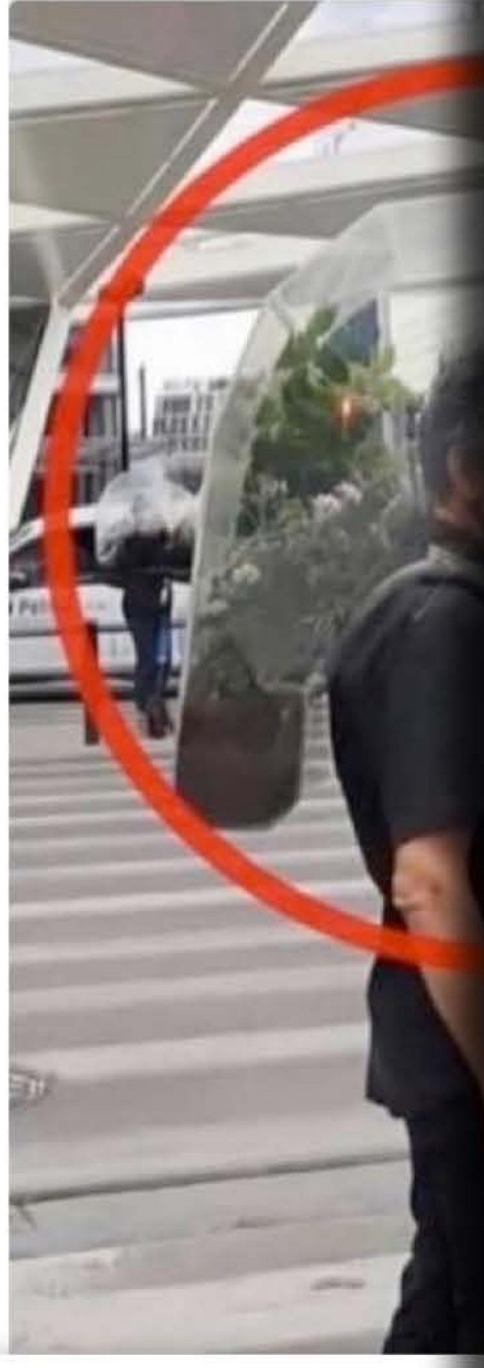
When you try an